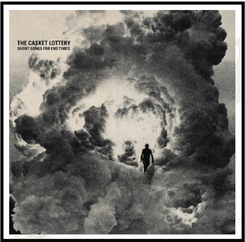
May two thousand twenty-two

PEACE AMONG THE OPPRESSED, WAR AGAINST THE OPPRESSORS!